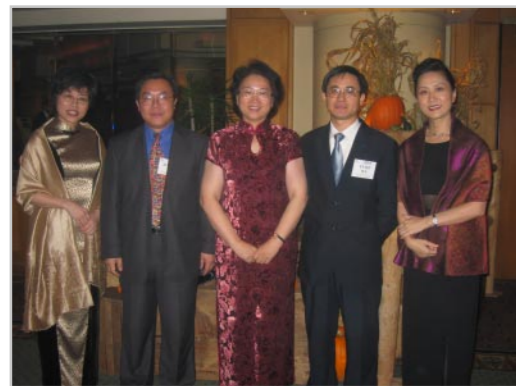
▲ 出席 AIPLA 年會的公司代表團成員 (2003年11月)。 The CPA delegates at the AIPLA annual meeting (November 2003).