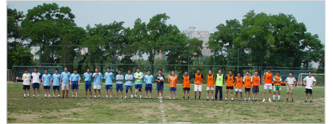
▲ 公司足球隊與專利局足球隊同場競技 (2003年7月)。 The CPA football team competing with the Patent Office team (July 2003).