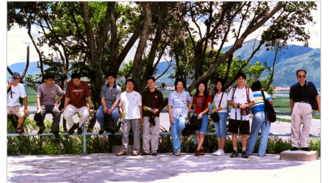
▲ 員工周末組織的郊游活動 (2003年7月)。 CPA employees going for an outing on weekend (July 2003).