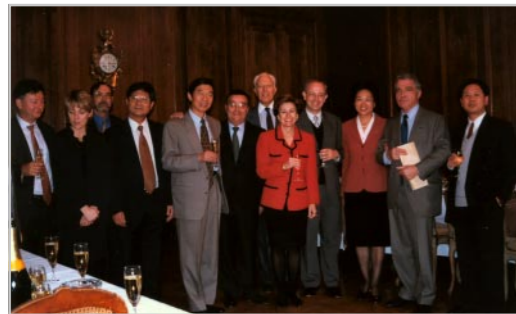
▲ 訪法期間，代表團與法國同行歡聚一堂（左三為中國駐法國大使吳建民 右二為法國工業產權全國理事會主席馬爾丁；1999年1月）。

1999年4月29日 日本特許廳長官伊佐山建志先生一行專程訪問公司香港總部，與公司負責人舉行了會談。雙方就兩國知識產權制度的架構、有關立法和執法情況以及專利代理制度等方面作了相互介紹和討論。